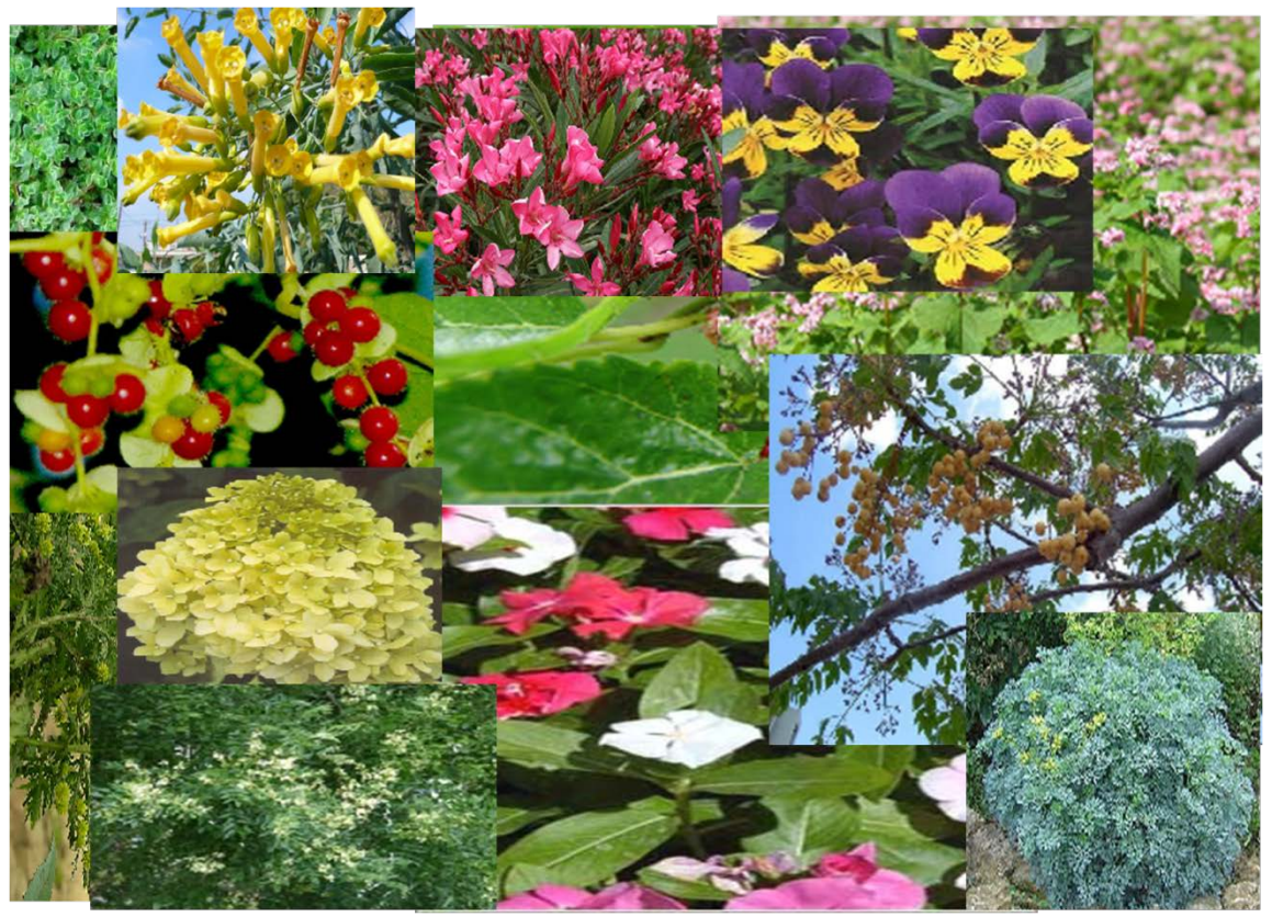
Figure 1.1 : Different types of plant species found in northeastern india.

Diversity and complexicity in biological system: Biological system has vast variety of organism. A large number of species you can see around you, whether it is insects, butterflies, different types of birds and other pet animals. Different types of plant species available in north-eastern india is given in the Figure 1.1.